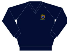
Woollen Jumper from $ 72.00