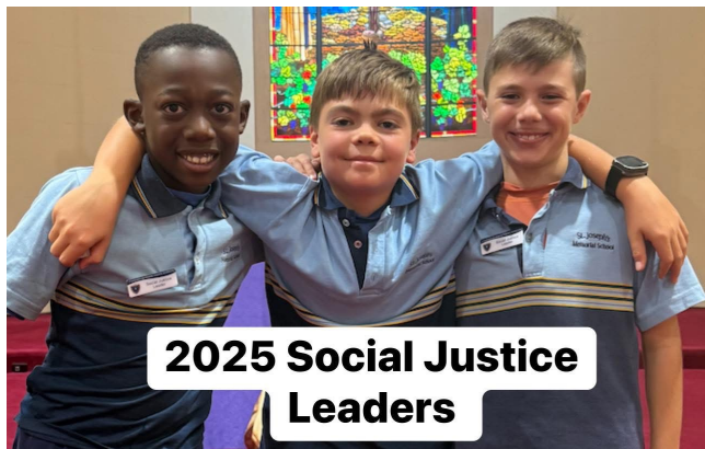
2025 Social Justice Leaders