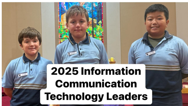
2025 Information Communication Technology Leaders