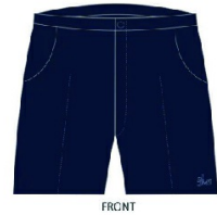
Elastic Back Shorts $ 39.00