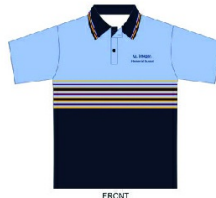
Sports Polo $ 59.00