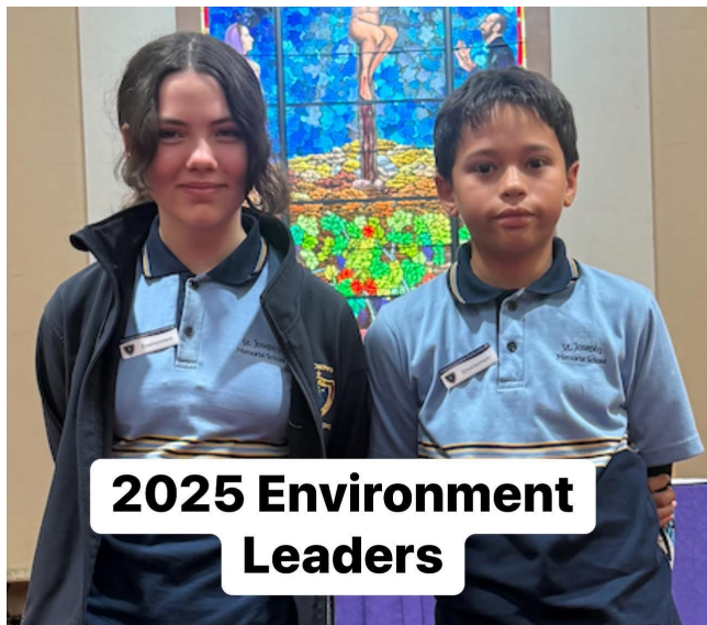
2025 Environment Leaders