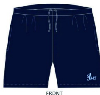
Sport Shorts $ 30.00