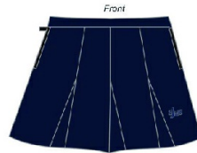
Skirt - Culottes $ 63.00