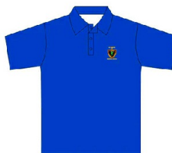
Pre School Polo $ 27.00