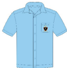
Short Sleeve Shirt $ 48.00