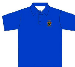
Pre School Polo $ 27.00