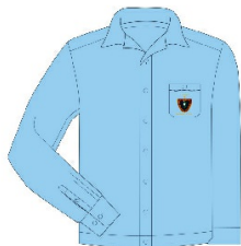
Long Sleeve Shirt $ 49.00