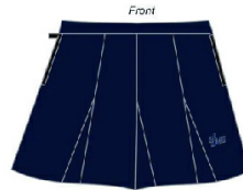
Skirt - Culottes $ 63.00