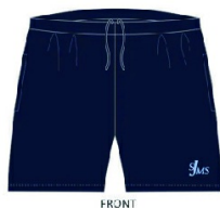
Sport Shorts $ 30.00