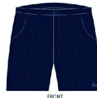
Elastic Back Shorts $ 39.00