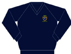
Woollen Jumper from $ 72.00