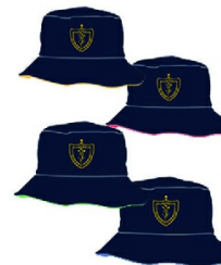
Reversible Bucket Hat $ 18.00