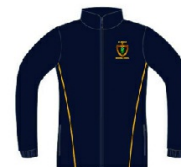
Softshell Jacket $ 86.50