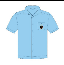
Short Sleeve Shirt $ 48.00