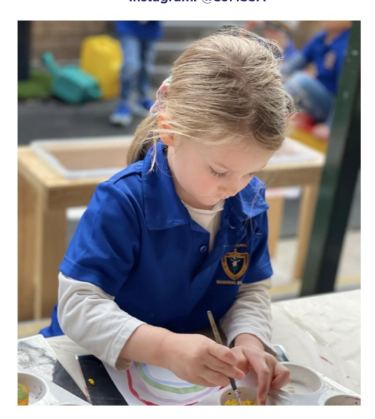
Your child is at the heart of everything we do

Website: www.sjms.catholic.edu.au Facebook: www.facebook.com/SJMSSA Instagram: @SJMSSA