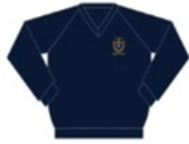
St Joseph's Norwood | Woollen Jumper