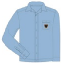
St Joseph's Norwood | Banded Shirt - Long Sleeve