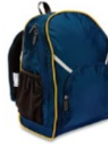
St Joseph's Norwood | Back Pack