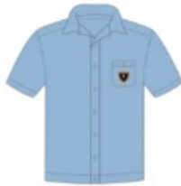
St Joseph's Norwood | Banded Shirt - Short Sleeve