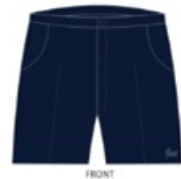
St Joseph's Norwood | Elastic Back Shorts