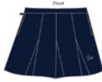
St Joseph's Norwood | Skirt (Culottes)