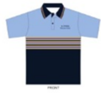
St Joseph's Norwood | Sports Polo