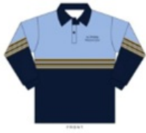
St Joseph's Norwood | Rugby Top