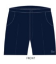
St Joseph's Norwood | Elastic Back Shorts