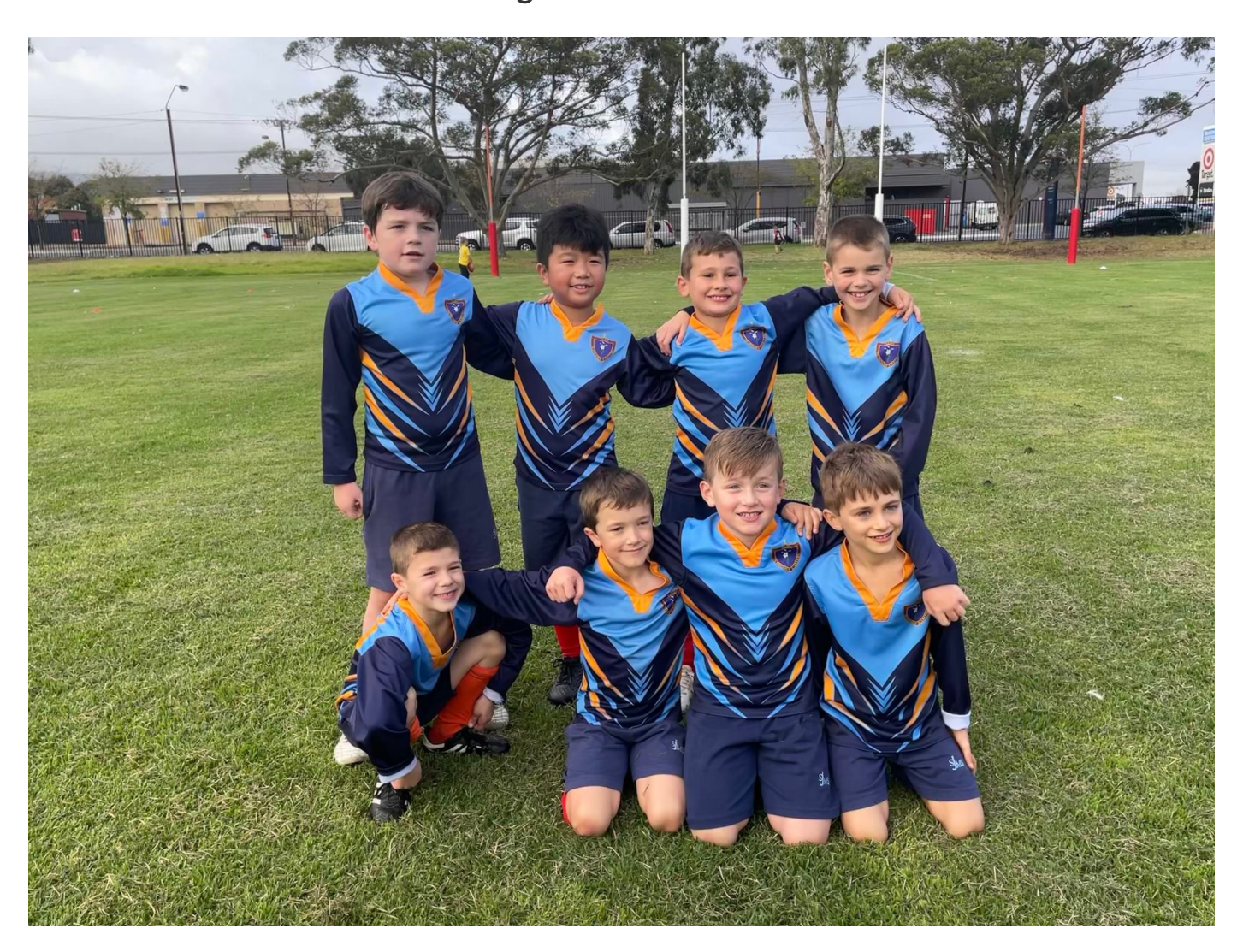
The 2021 Football season has begun!