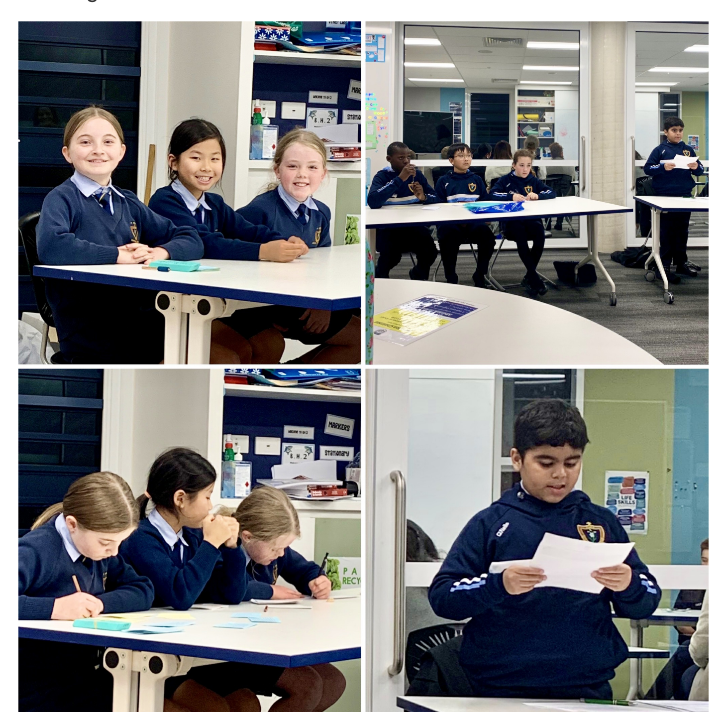
The 2021 Debating season commenced with 3 SJMS teams taking part in debates at Pultney Grammar. We look forward to our fourth Debating team participating in their debate this Tuesday 25 May.