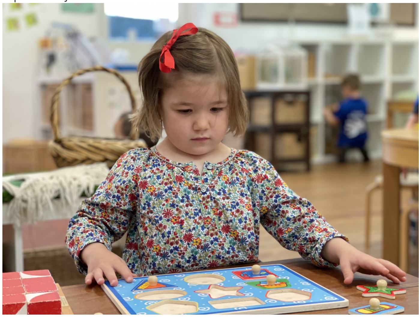
The upcoming Pupil Free Days for Reception to Year 6 are: