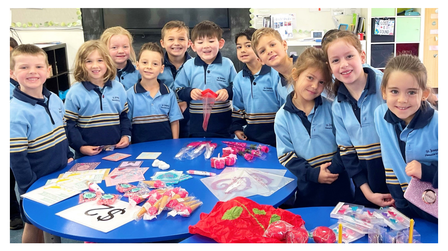
For dates, information on events and more, please visit the SJMS Calendar.